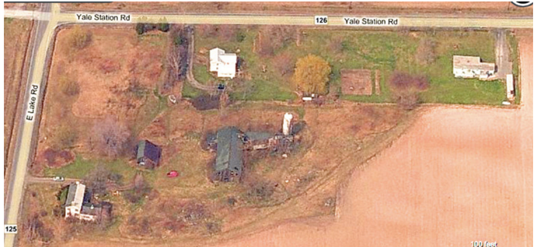
2008 Satellite View

lots, each approximately 75' wide and 80' deep. The first sale was to Leo Mulvey, Sr., who purchased two center lots in 1924. He chose those particular lots because of some stately elm trees that graced the property.